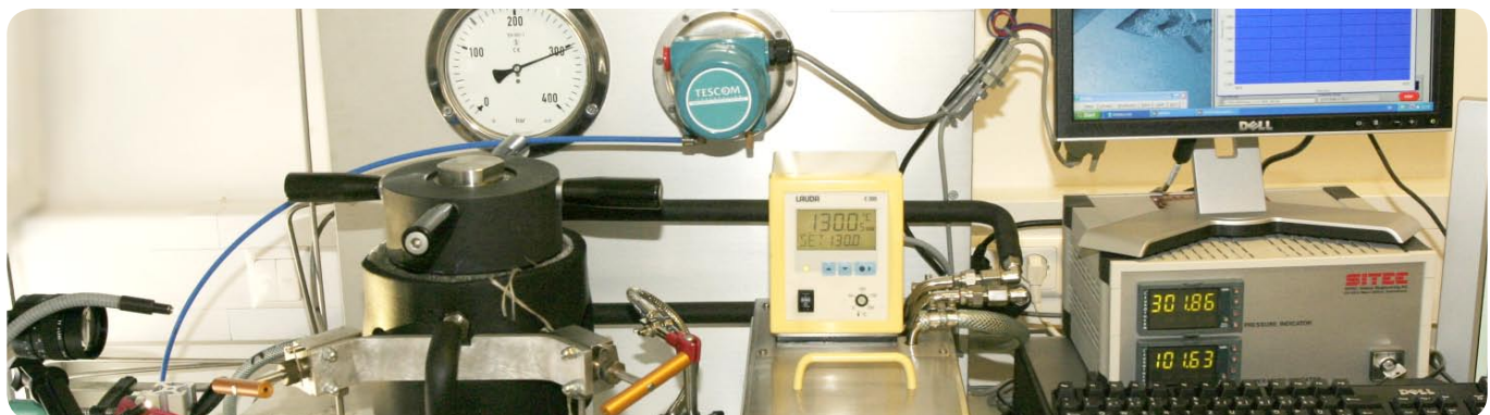
Testing equipment, R & D

Evaluation of the tests has been performed as visual inspection with a rating according to the respective standards. The respective rating systems can be found in Annex 1 to this document.