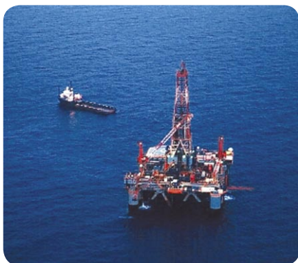
Oil and Gas industry

Some test results of the following materials are reported in this document. These tests were carried out at SKF Economos GmbH in accordance with well known test standards for ED tests for elastomeric materials for the Oil and Gas industry.